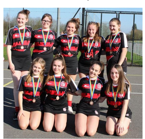
Congratulations to the Winners and Well Done to all teams involved.

For more information about Netball in Hertfordshire, please contact: